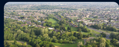
Swindon 31 days to let agreed