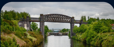
Warrington 27 days to let agreed