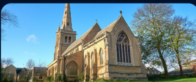
Mansfield 30 days to let agreed