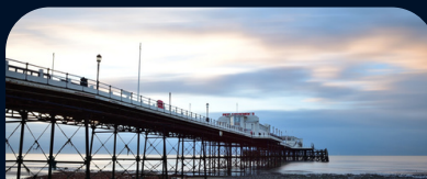
Worthing 30 days to let agreed