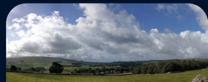
Burnley 29 days to let agreed